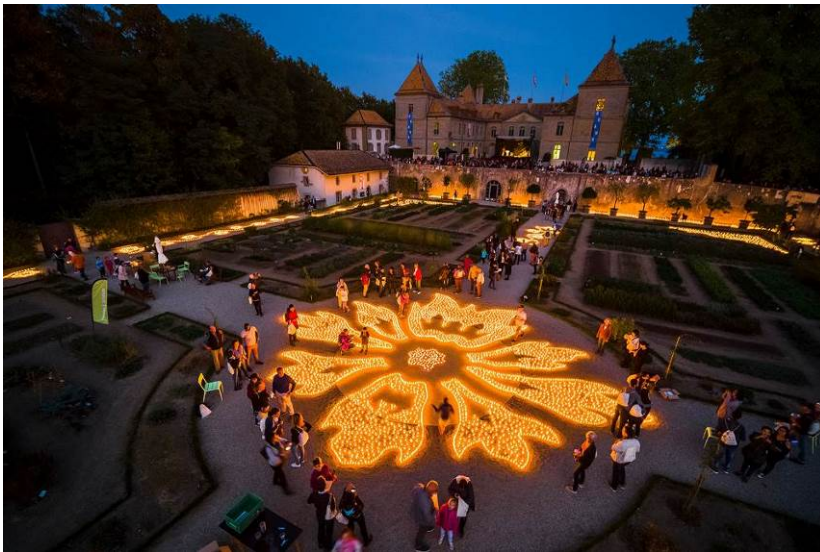
Flowers of Fire – museum's 20th birthday

The château was offered to the Swiss Confederation by the cantons of Vaud and Geneva in 1975 and thereafter became the base for the Swiss National Museum in French-speaking Switzerland. It opened to the public in 1998, inaugurating a permanent exhibition space devoted to life in Switzerland between 1730 and 1920. It is the only history museum of its size in the Lake Geneva region and was an immediate success with enthusiasts and tourists visiting the area. Since its inception, more than a million people have passed through its doors. It has hosted some 50 temporary exhibitions and has also been the venue for numerous music and theatre events.